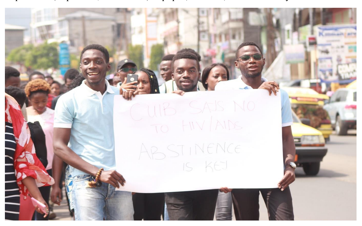
On Campus screening during World HIV/AIDS Day

The unit promotes health and prevent diseases through health education and campaigns (e.g. World HIV/AIDS Day), counselling and vaccinations of some diseases of public health importance (Hepatitis B, Tetanus etc.) to pupils, students, staff and faculty.